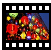
Local feed (Singapore)