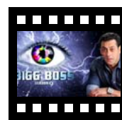
Satellite feed (EMEA)

No broadcast rights for Bigg Boss in Africa