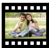
Ice cream ad (Dubai)